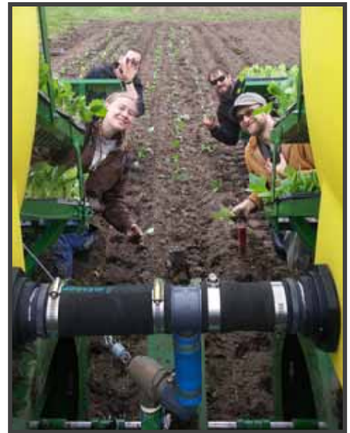
Planting seedlings.