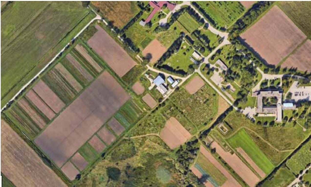
An aerial map of the South West Portion of the Ignatius Jesuit Centre. The CSA Fields can be seen on the middle of the left portion of the photo.