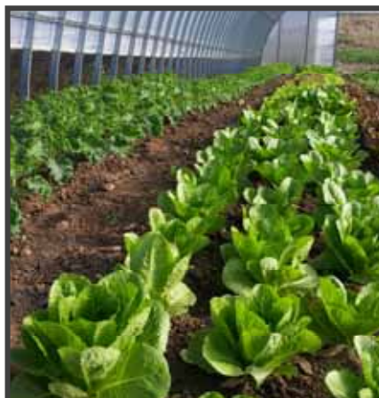
Greens in the new poly-house

Other than the shared lunches, interns decide together on their household arrangements for shared shopping, meal preparation, and chores.