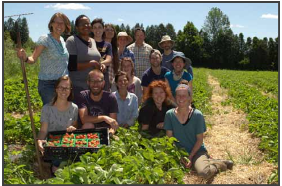
2018 Ignatius Farm Team.