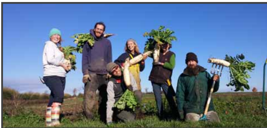
Harvesting daikon.

'Oh, to Grow - Educational Primer for New Farmers', intern resource manual, and library access provided