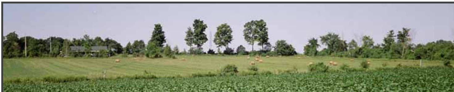
Top right of page: Harvesting carrots; Bottom of page: