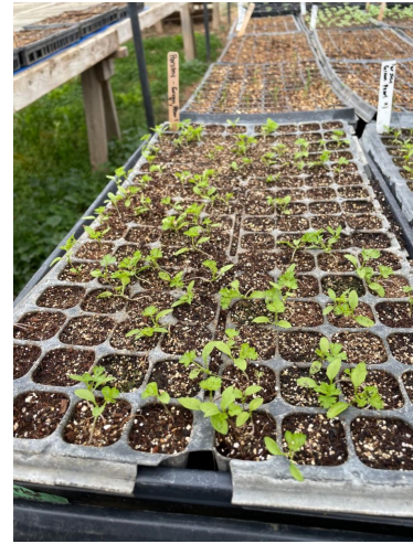
The seedlings are growing!