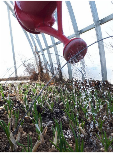
Watering garlic in the hoop house