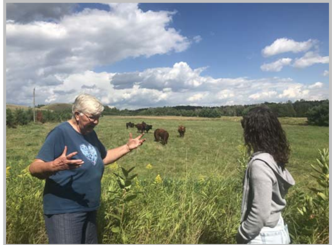
Field trip to Whole Village (Above) and Fiddlehead Nursery