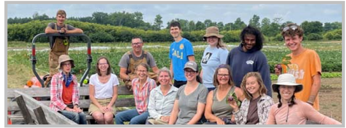
Farm Team 2022

We thank all applicants in advance; only those selected for interviews will be contacted.