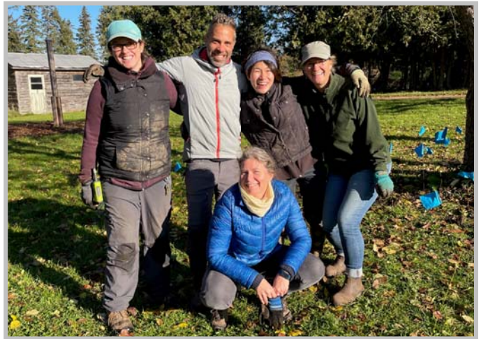
Make great memories!