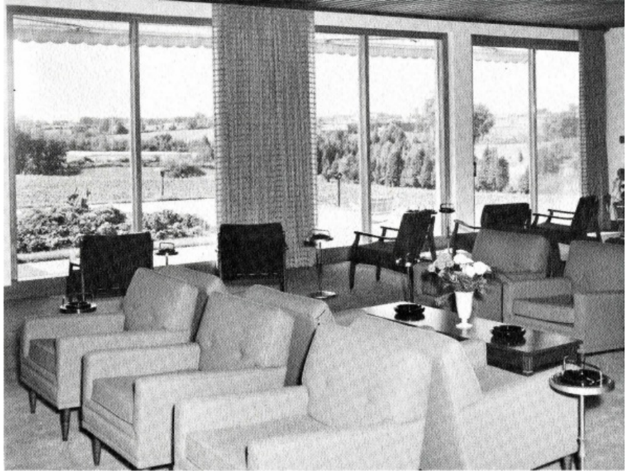
LOUNGE — Spacious, cosy, overlooks quiet countryside