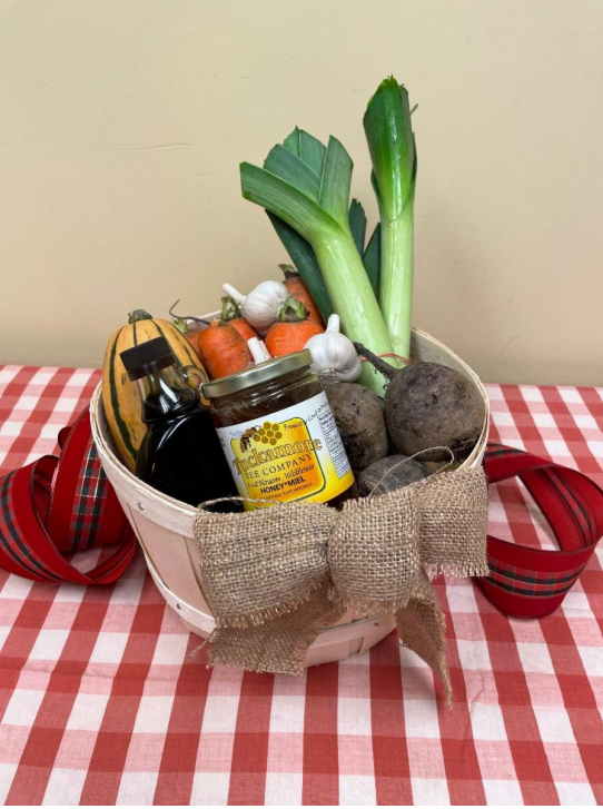
Holiday Gift Basket