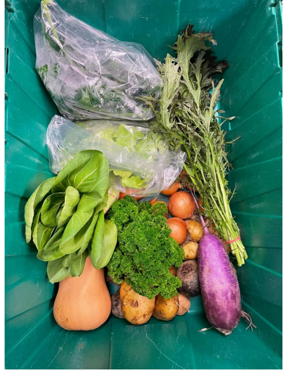
Holiday Veggie Share

Check out the latest Farm E-news here to stay up to date with what's happening at the Farm.