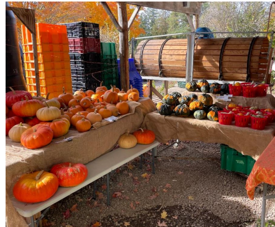
Squash and gourds for CSA Members

What an October! Glorious colours and bountiful, beautiful and delicious harvests have nourished us daily.