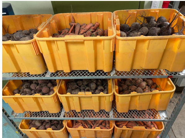
Freshly harvested root vegetables waiting to be washed for the CSA members