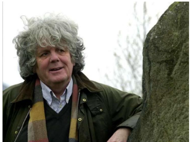
John Moriarty

The Irish poet and essayist John Moriarty's ecological thinking is intricately connected to a sacramental vision of the whole of creation. As the Canadian political philosopher Charles Taylor says: "it is through story that we find or devise ways of living bearably in time." Moriarty knew that "only a great story can shelter us" and by the time he died in 2007 he had provided a new and provocative vision that incorporates the wisdom tradition of all faiths.